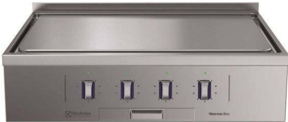
588503 (MBLDBBHOAO) Electric Solid Top, 4 zones, ecoTop coating, one-side operated with backsplash